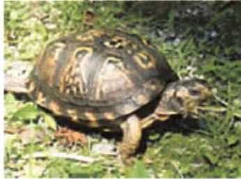
Brutus, a Blandings Turtle which is rare in Maine, was among many creatures discussed with the educators from Chewonki.

WLA is proud to underwrite a program of their choosing each year for students at Prescott School (K-6) here in Washington. This year's program was about the wildlife that lives in riparian zones - those places which are along the water's edge - and in vernal pools.