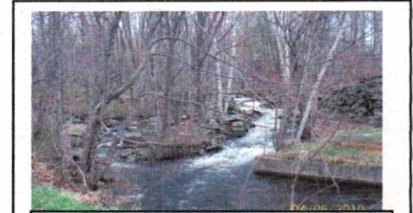
Medomak Stream in Spring

Washington Lakes Association will meet on Thursday, July 15 at 7 p.m. at the new Mount Olivet Masonic Hall, 48 Liberty Road – just north of the village on Route 220. Desserts and beverages will be served.